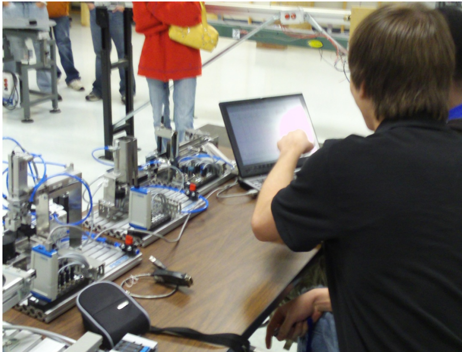
Students from Holiday ISD use Festo Meclab at Tech Prep Career Day.

Our final activity for recruitment was the Tech Prep Junior High safari held November 18 th . Over 1300 students attended this event. Students used the Festo Meclab equipment to create circuits that control the equipment.